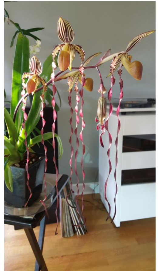
Figure 1 Paph. Michael Koopowitz

One important note – when displaying orchids, it is important that they be checked beforehand for pests or disease. Pests can disqualify a plant from AOS judging at shows, and at our meetings we uphold the same standard.