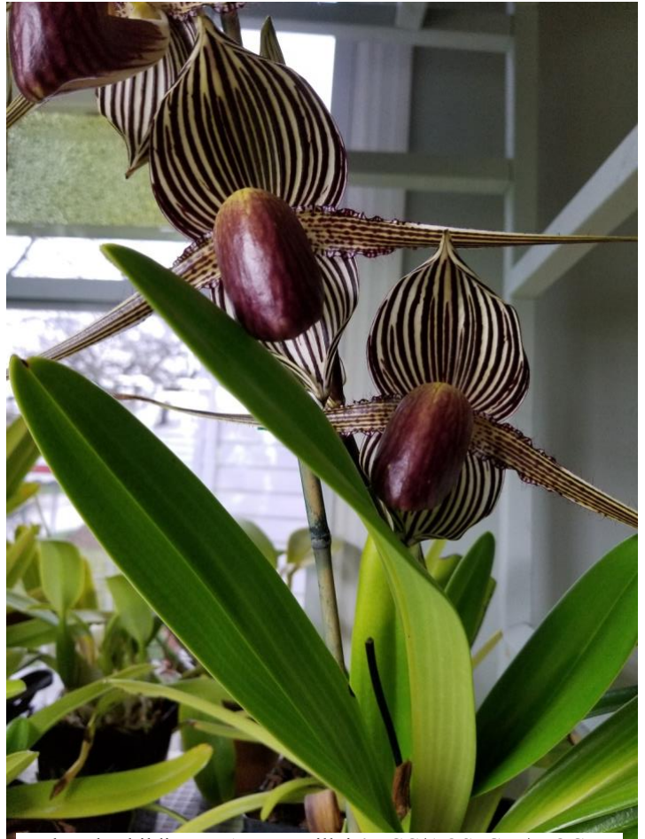
Paph rothschildianum 'Mont Millais' FCC/AOS, GM/WOC

Calling all COOS members, we need pictures of your orchids! Nancy Shapiro is creating a presentation on orchids that we can give to other plant and garden societies (and may even share at one of our meetings next year), but she needs your photos. Flower pictures are great, but she could really use pictures that include the whole plant. In particular she is looking for Cattleyas, Dendrobiums, Oncidiums, Paphs, Phrags, Phals, and all the usual suspects. We really want to show off all the great plants you all grow! If you have a picture you can share please email it to her at nlshapiro2@gmail.com .