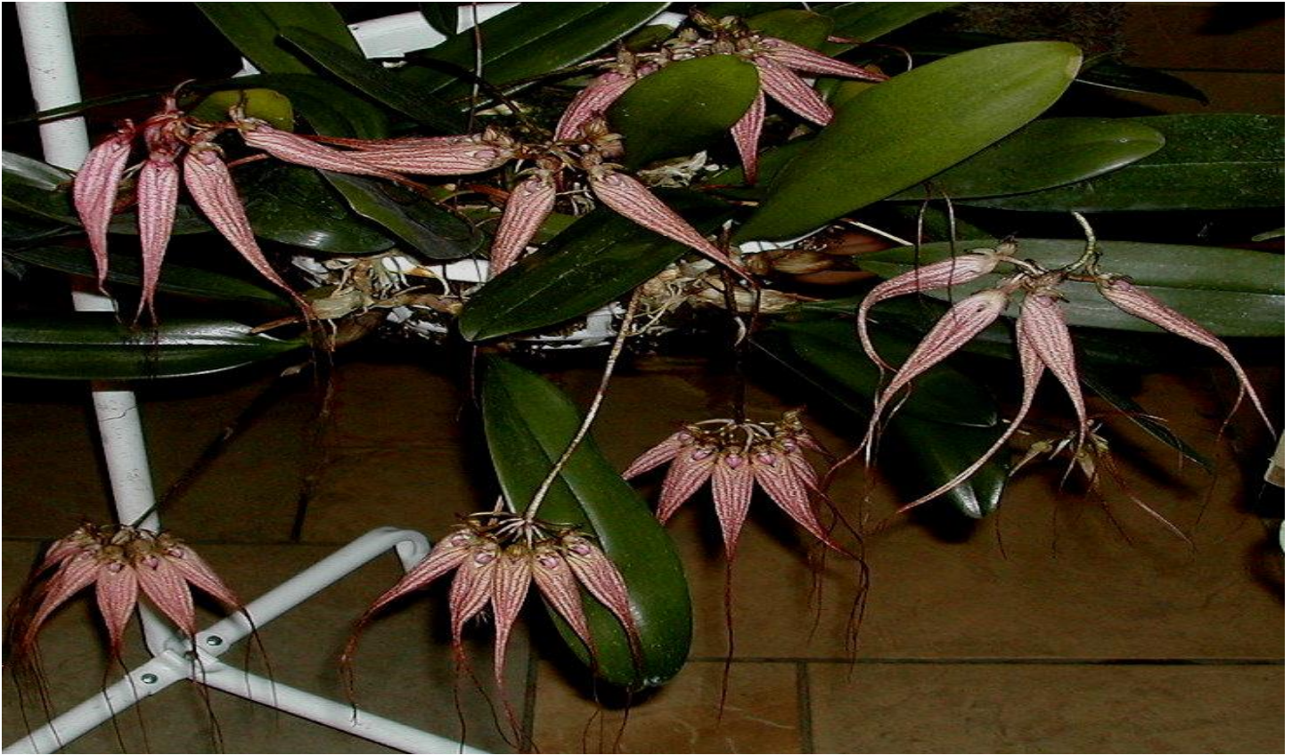
Bulbophyllum Elizabeth Ann

As always...collecting and posting the winning plant info is sometimes an inexact science. If you believe you had a plant that was recognized that we have not mentioned in the above, please let me know.