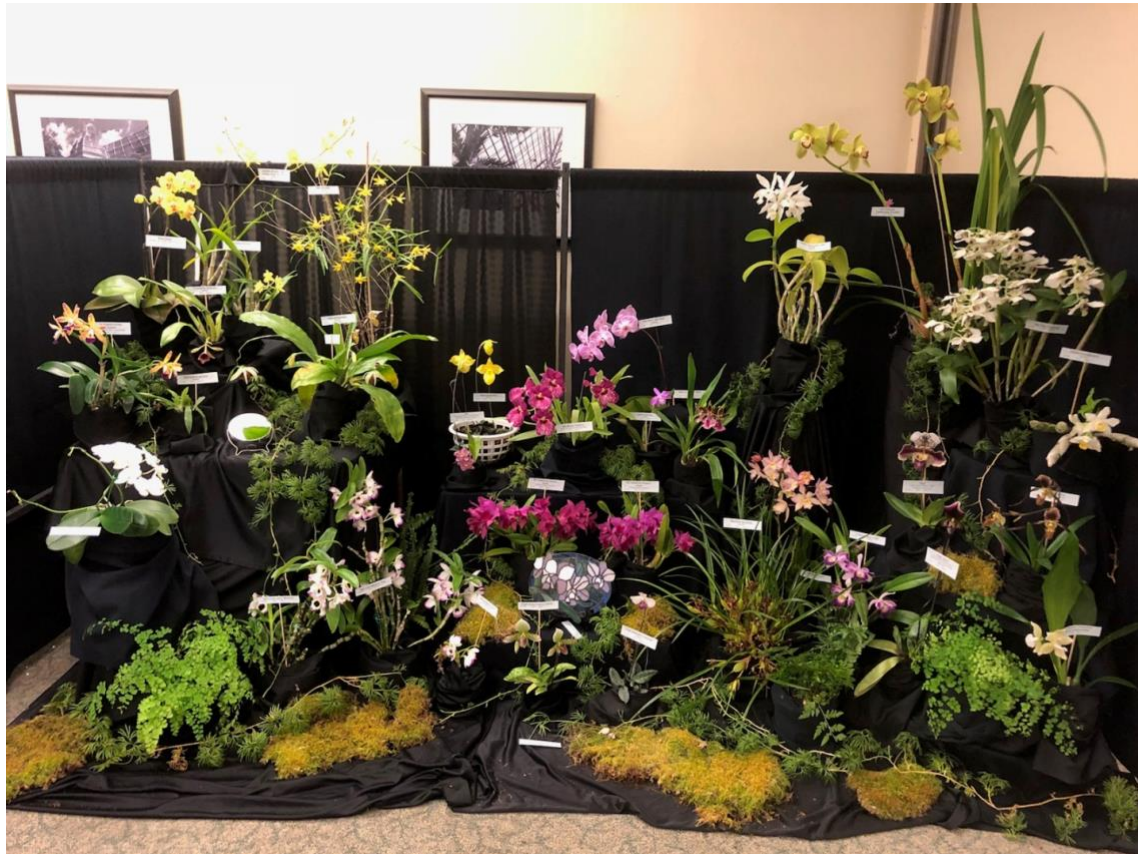
Central Ohio Orchid Society – Spring Show Exhibit