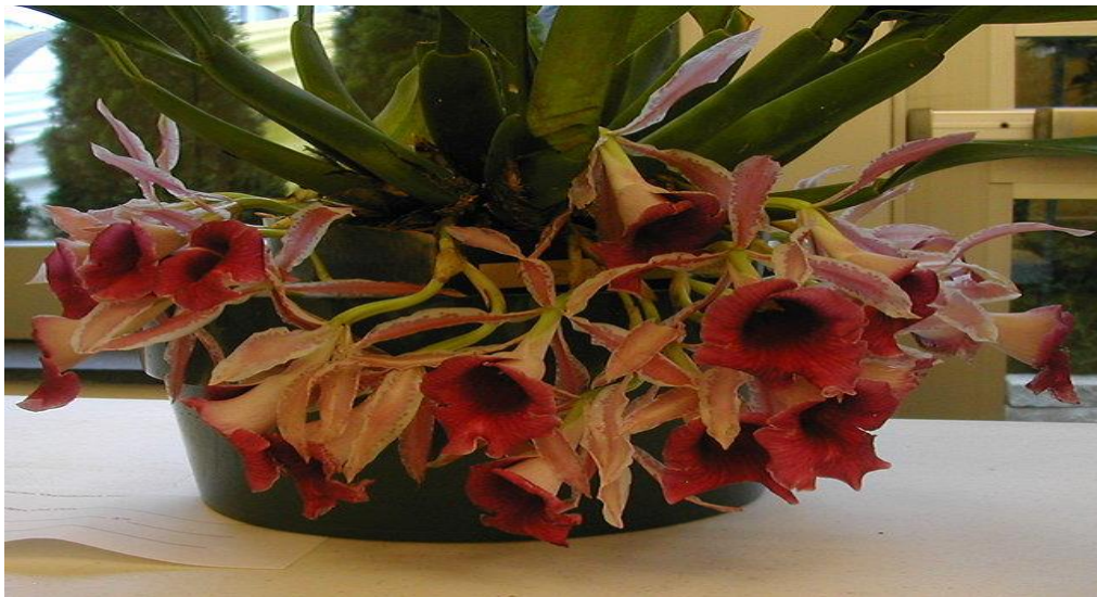
Trpla Charles 'Orchid Court Too'

The dues are $20.00 for Individuals and $25.00 per household.