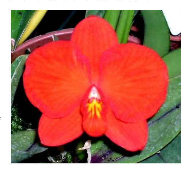
Sophronitis coccinea 4N - Japan Popow Orchids