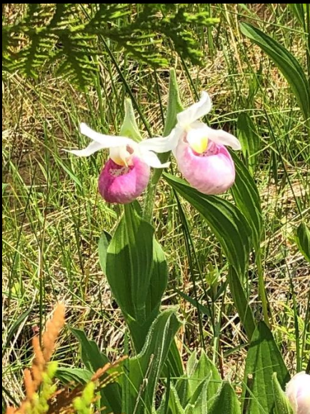
Cyp. reginae in Cedar Bog

It will be more likely to grow well for you, and you can rest easy at night knowing that no plants were dug out of the wild for your garden.