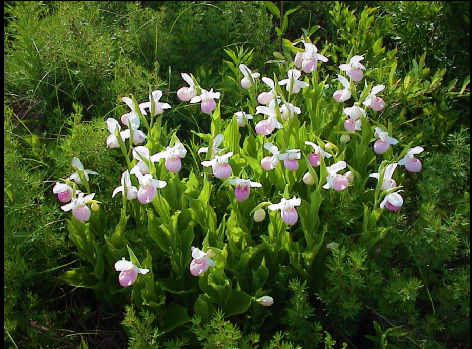
Cyp. reginae in northeast Ohio

There is no need to remove these plants from the wild. This species is one of the easier Cyps to grow from seed, and a number of commercial outlets have artificially propagated plants for sale. If you want to try growing one of these beauties in a flower bed, (they are pricey, and a bit challenging to grow) get one of the lab-grown plants.