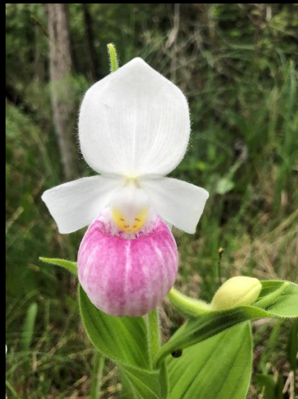
Cyp. reginae in Cedar Bog