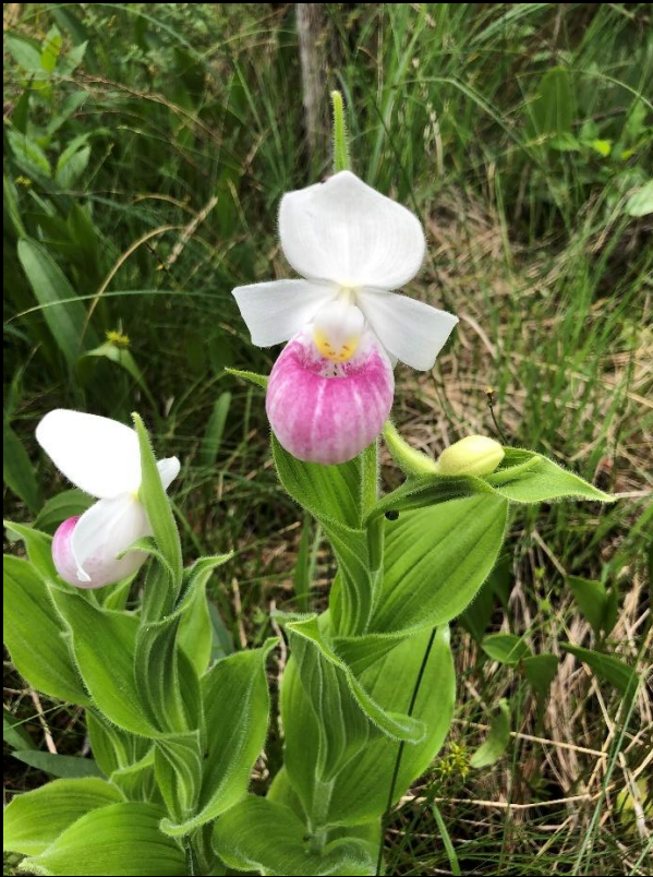
Cyp. reginae in Cedar Bog.

And such high praise in scientific naming is rightfully deserved. They stand up to one meter (40 inches) tall, with one to three flowers at the top of each blooming stem. The flowers are large, up to 4 inches (10 cm) in natural spread. The color is eye-catching. The sepal and petals are bright white, while the lip (pouch) varies from light pink to dark raspberry. There is also an alba form, which is snowy white throughout the flower.