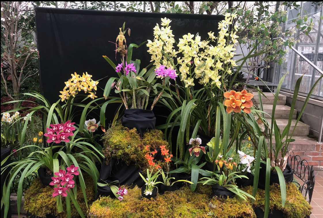
Central Ohio Orchid Society display at the Greater Cincinnati Orchid Society's spring show. Outstanding job to Ken Mettler!