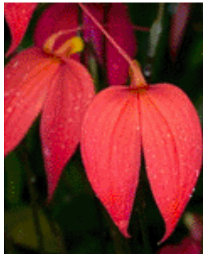
Masdevallia coccinea