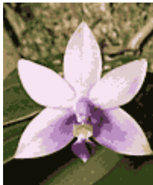
Phal. violacea var. coerulea - ©2009 Greg Allikas

As mentioned last month, the American Orchid Society (AOS) has recognized the need to increase the ranks of available accredited judges. To meet this goal, the AOS is making several changes to the process required to reach the accredited status. One of the most promising educational opportunities was recently revealed in the latest issue of Orchids Magazine (March 2024) where a number of new on line educational resources are being made available to student judges who have been accepted into the judging program. These resources are also available to AOS members who just want to learn more about the orchids they grow and what may make them award winners. Please check out the Awards and Judging tab on the AOS.org website for more information about becoming a judge or just learn about some amazing plants.