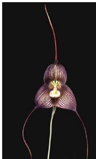
Drac. vampira - ©2009 Greg Allikas

Andres will be offering plants for sale at our March meeting!