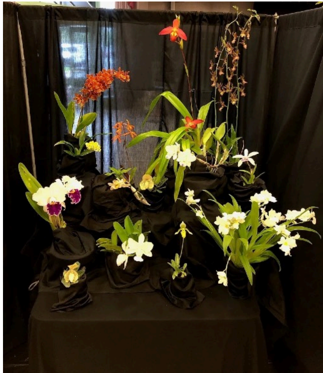
Central Ohio Orchid Society display at the 2023 West Shore Orchid Society Spring Show

Individual Plants can be entered for judging