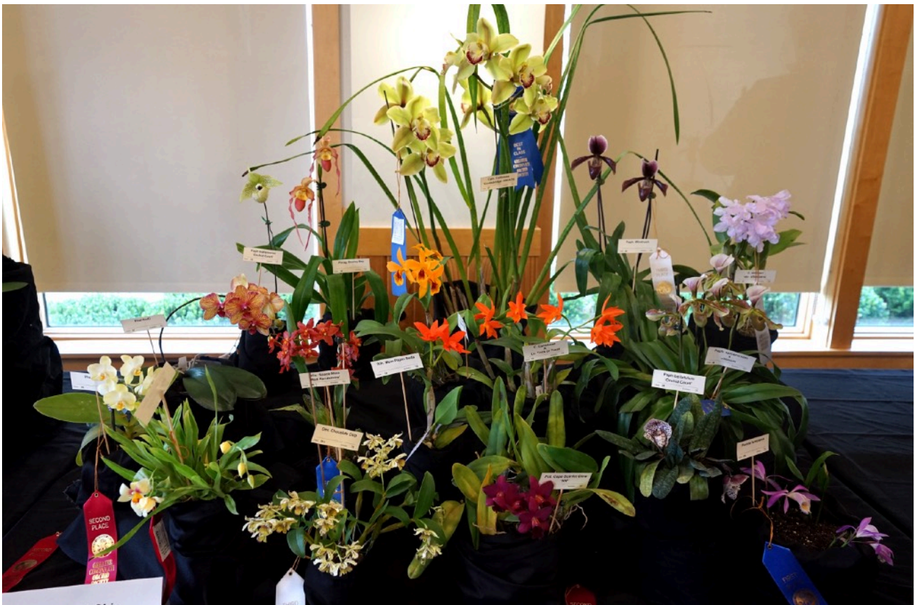
Another view of our display at the Greater Cincinnati Orchid Society Show, this time with ribbons awarded.