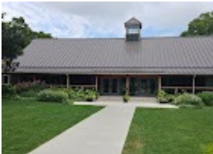
The Wells Barn at the Franklin Park Conservatory