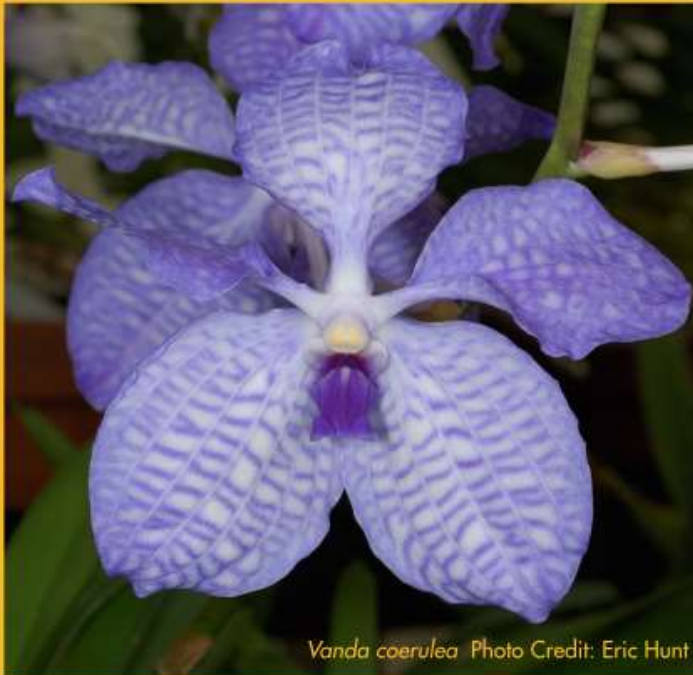
Vanda coerulea

THE MASSACHUSETTS ORCHID SOCIETY PRESENTS