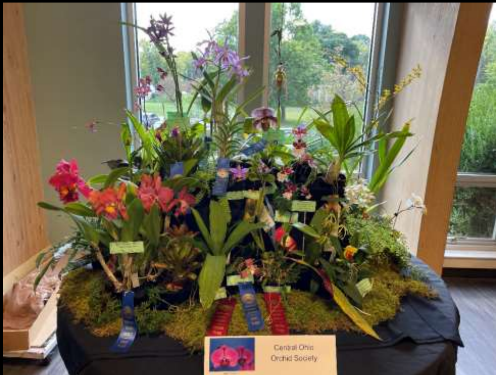
COOS Display at Kentucky Orchid Society Orchid Show, Megan Osika