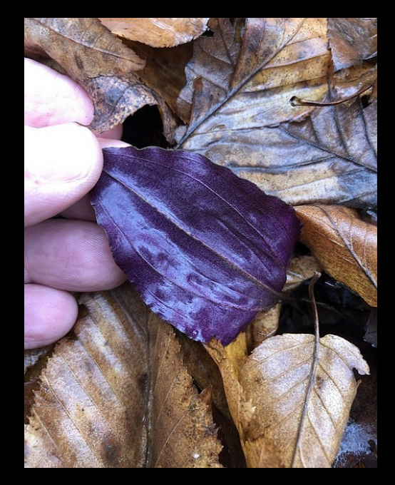
Tipularia discolor. Underside of leaf.

The seeds mature in November, and can blow for many miles before they land and possibly germinate. They like to germinate on rotting wood, and it's not uncommon to find three to six plants growing in a nearly straight line in the woods. This is because there used to be a rotting "nurse log" there, which allowed the seeds to germinate. The log may be long gone, but he plants remain, and mark the place where it used to be.