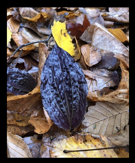
Tipularia discolor. Purple leafed form.

All these traits are related to pollination by small moths in the Noctuidae family. All these moths are covered with fuzzy scales over their bodies and wings. These scales are easily rubbed off, and don't make a good place to attach the flowers' pollinia. So, this orchid species is adapted to placing its pollen on the compound eyes of the moth. Thus, the reason for the asymmetry: the flowers are shaped to deposit pollen on either the left, or the right eye. The anther cap doesn't fall off the pollinia for a few minutes, giving the moth time to travel to another plant, thereby decreasing the chance of self-pollination. When the moth visits another similarly oriented flower, the pollen is deposited on the stigmatic surface. The somewhat disturbing detail is that the attachment of the pollinia to the eye can sometimes be stronger than the attachment of the eye to the moth. In late July, there are a number of one-eyed moths flying about the woods of southern Ohio.