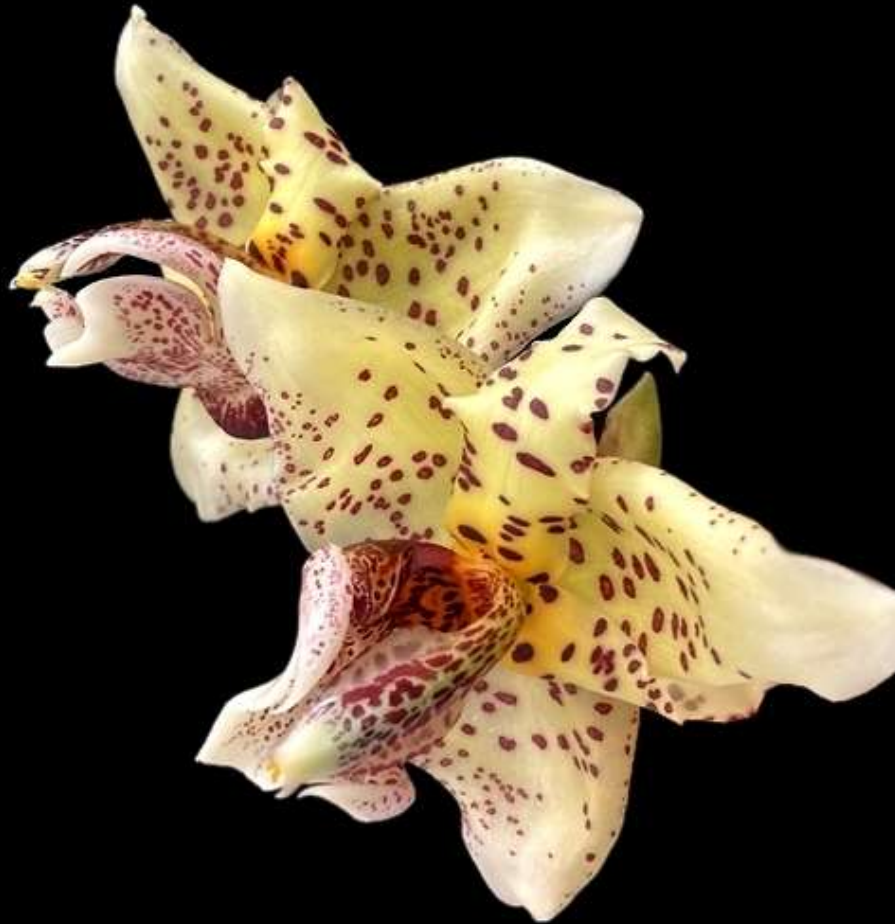
Stanhopea Shinjik Grown by Dennis Steinbeck

Stanhopeas grow with large leaves, and bear spikes with intricate, pendulous flowers. They appreciate bright light and intermediate temperatures with cooler nights. They thrive with plenty of water and regular feeding during the growing season. Pot in baskets with medium fir bark mixed with a little sphagnum to retain moisture.