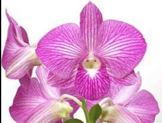
Dendrobium Burana Stripe . A popular, easy phalaenopsis-type hybrid.