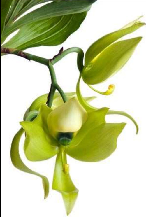
Cycnoches chlorochilon , the green swan orchid.