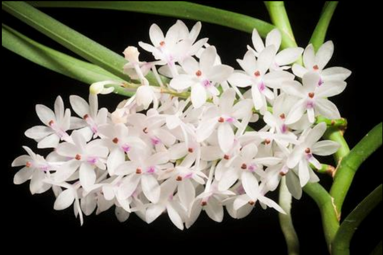
Vanda christensoniana