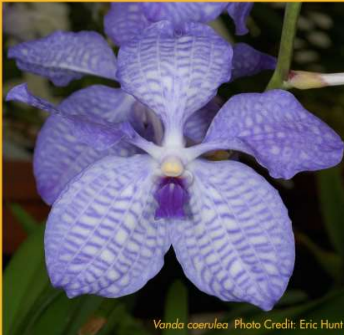
Vanda coerulea

THE MASSACHUSETTS ORCHID SOCIETY PRESENTS