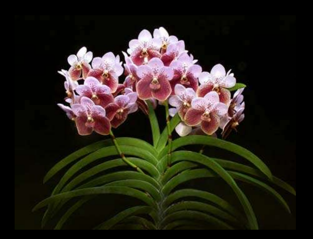
The Philippine species, Euanthe sanderiana , rewards growers with massive heads of flowers at the end of summer