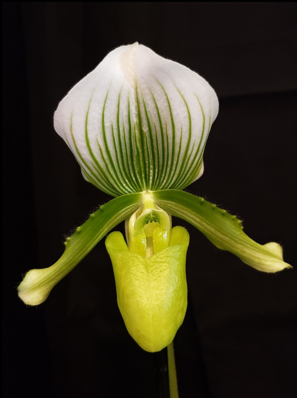
Paph. Hsinying Citron '#6' x Paph. Maudiae 'Silverado' AM/AOS Grown by Cortney White