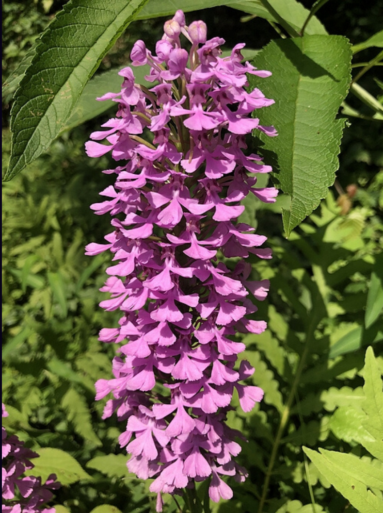
Purple Fringeless Orchid, Platanthera peramoena

Fairly common in southeast Ohio, the Purple Fringeless Orchid ( Platanthera peramoena ) also ranges throughout much of the eastern United States, from New Jersey to Georgia, and westward to Missouri and Arkansas. It grows mostly in moist areas such as wetlands, streambanks and roadside ditches, although I have found the occasional plant high up on a wooded hillside.