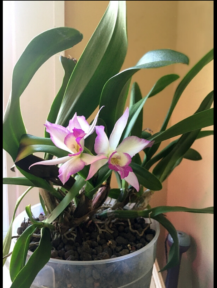
Cattleya Appleblossom Grown by Troy Timbrook