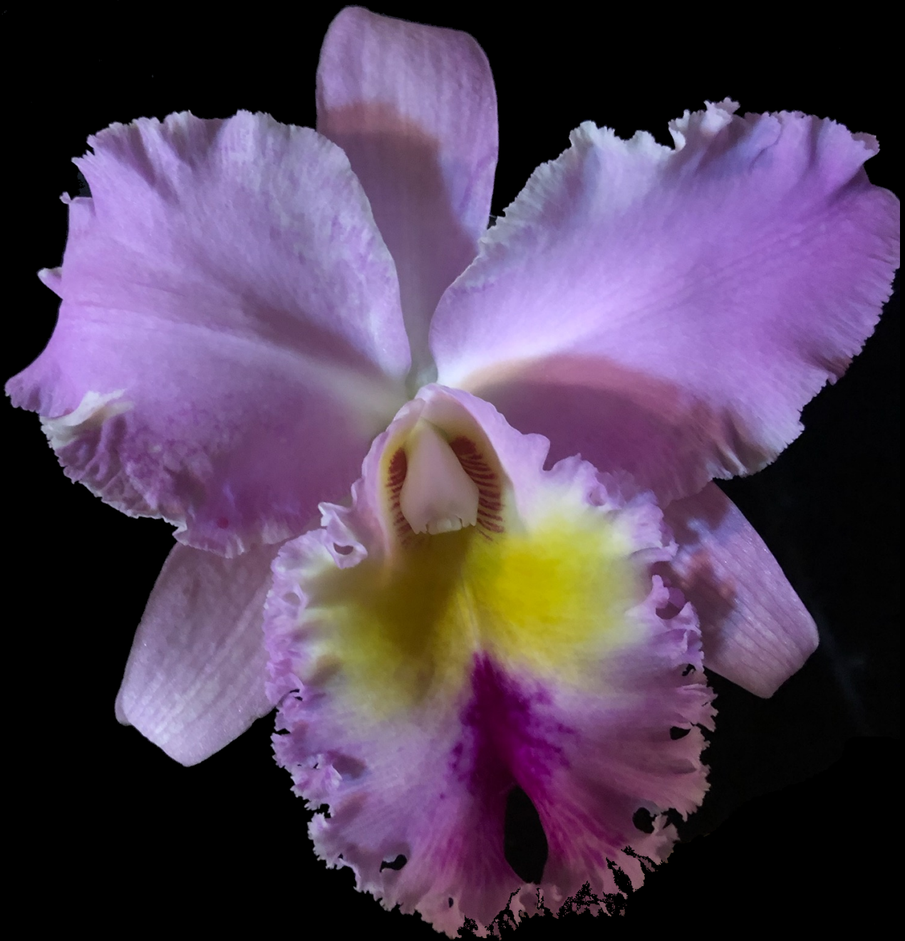
PBLC PAMELA HETHERINGTON 'CORONATION' FCC/AOS GROWN BY KEN METTLER FROM THE WAGNER ESTATE ORCHID DONATIONS