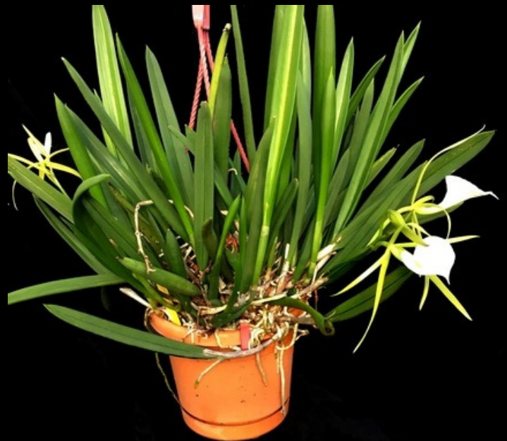
B. nodosa Grown by Troy Timbrook