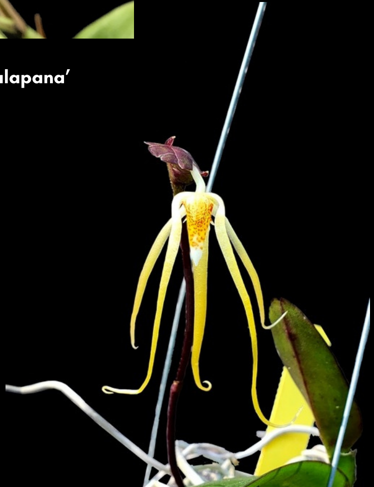
Thrixspermum Centipeda Grown by Cortney White