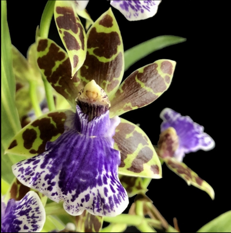
Zygopetalum Jumpin Jack 'Kalapana' Grown by Angeline Rini