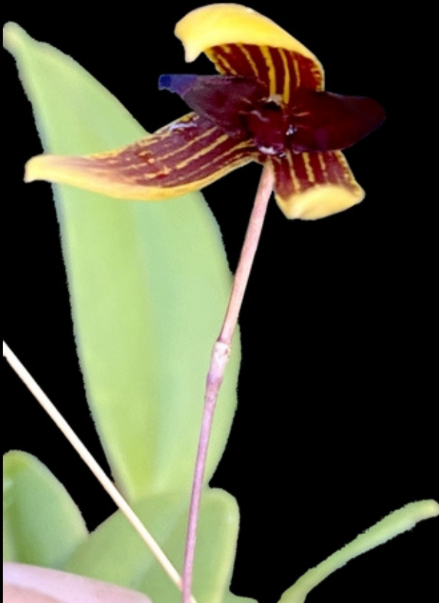
Bulbophyllum pardolatum Grown by Dennis Steinbeck