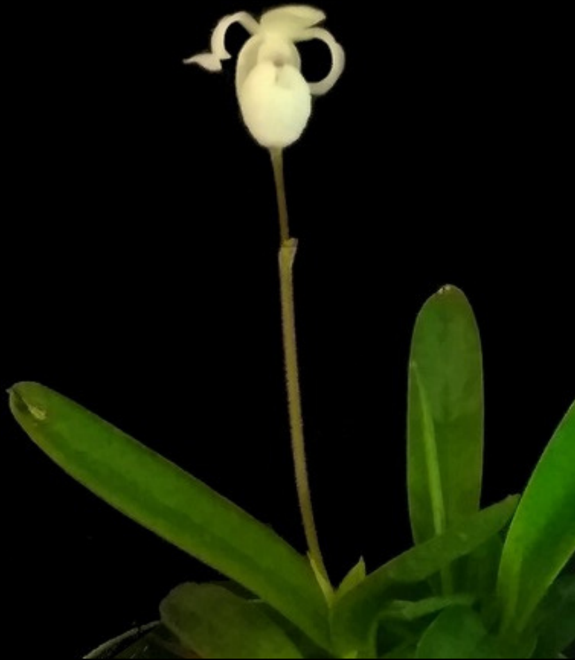
Mexipedium xerophyticum 'Oaxaca' Grown by Tom and Pat Stinson