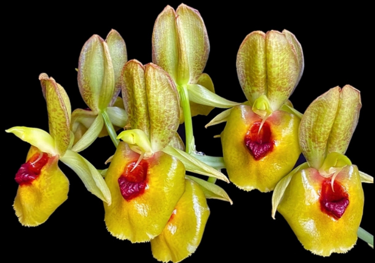
Ctsm. tenebrosum (Mislabeled) Grown by Tessie Steelman