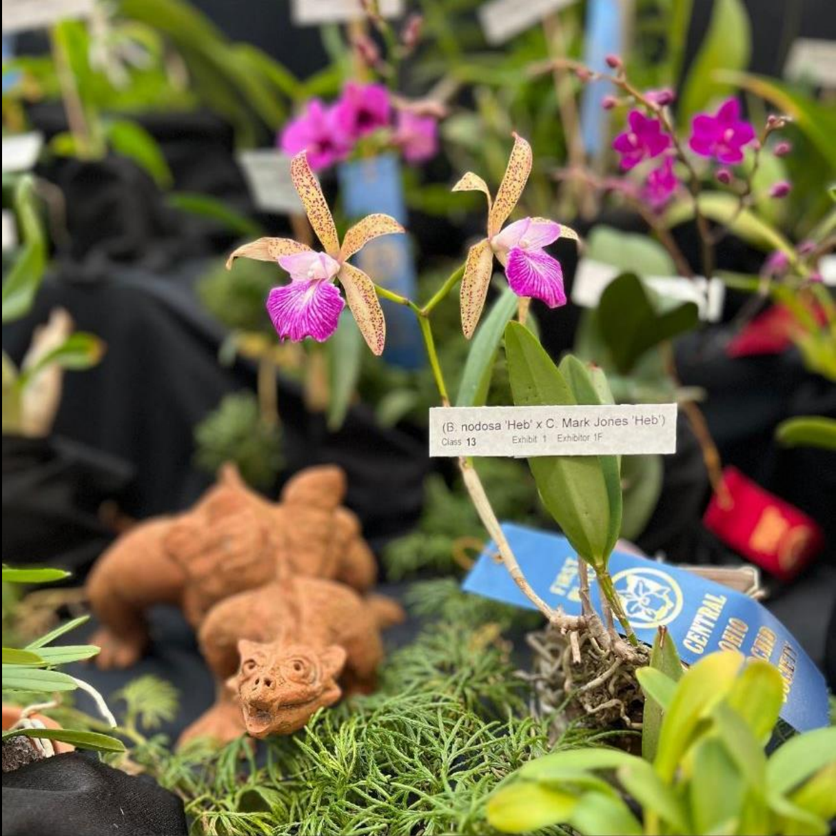
(B. nodosa 'Heb' x C. Mark Jones 'Heb') Class 13 Exhibit 1 Exhibitor 1F