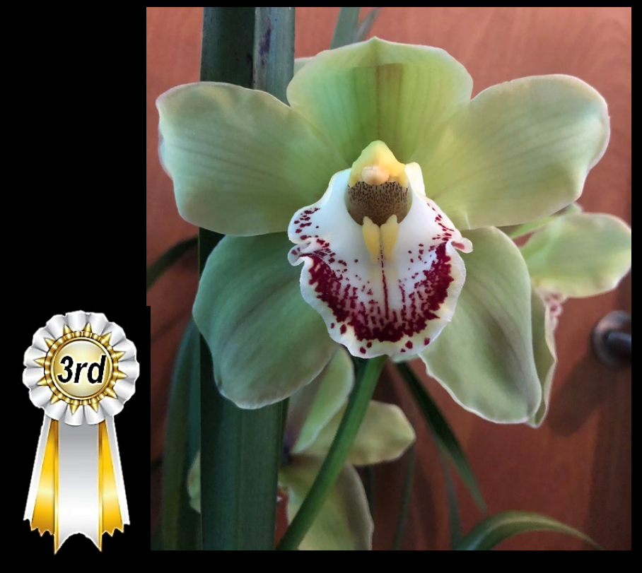
Cym. Caithness 'Cooksbridge' FCC/RHS