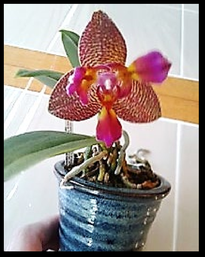
Phalaenopsis Joy Fairy Tale (Ho's Princess Arai x Coral Isles)