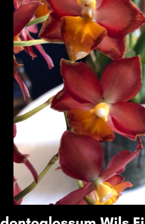
Odontoglossum Wils Firecat 'Snake'