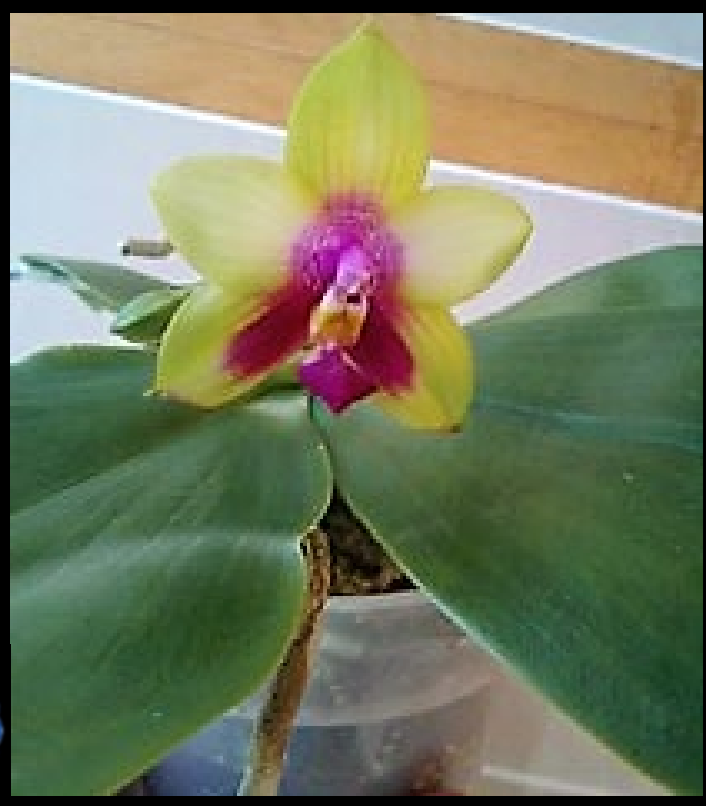
Phalaenopsis LD's Bear Queen (bellina x dragon tree eagle)