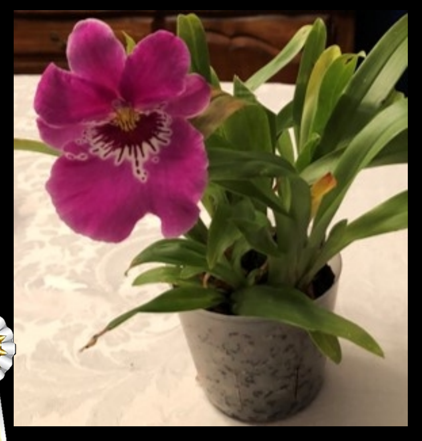
Miltonia Lover's Point 'Kalapana'