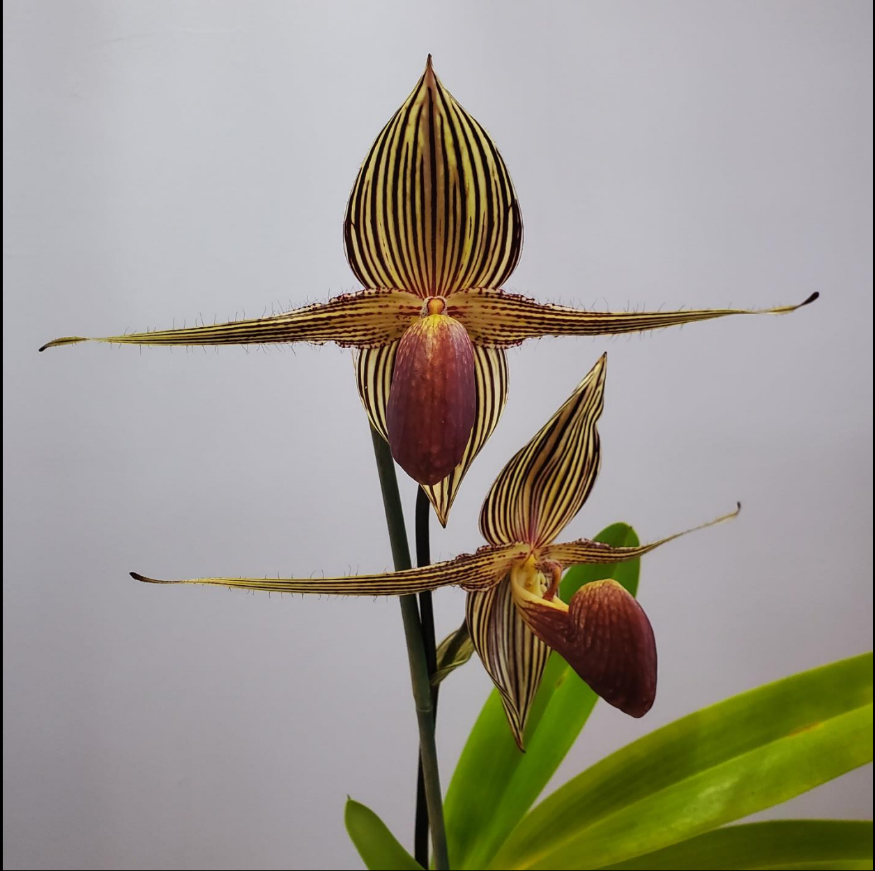
Paphiopedilum rothschildianum 'Rex Jr.' x 'MM Best'