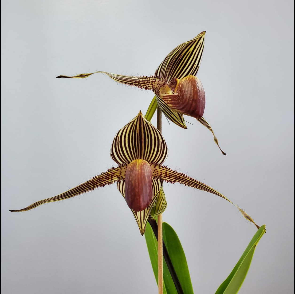
Paphiopedilum rothschildianum 'Chester Hill' x 'Red Baron'