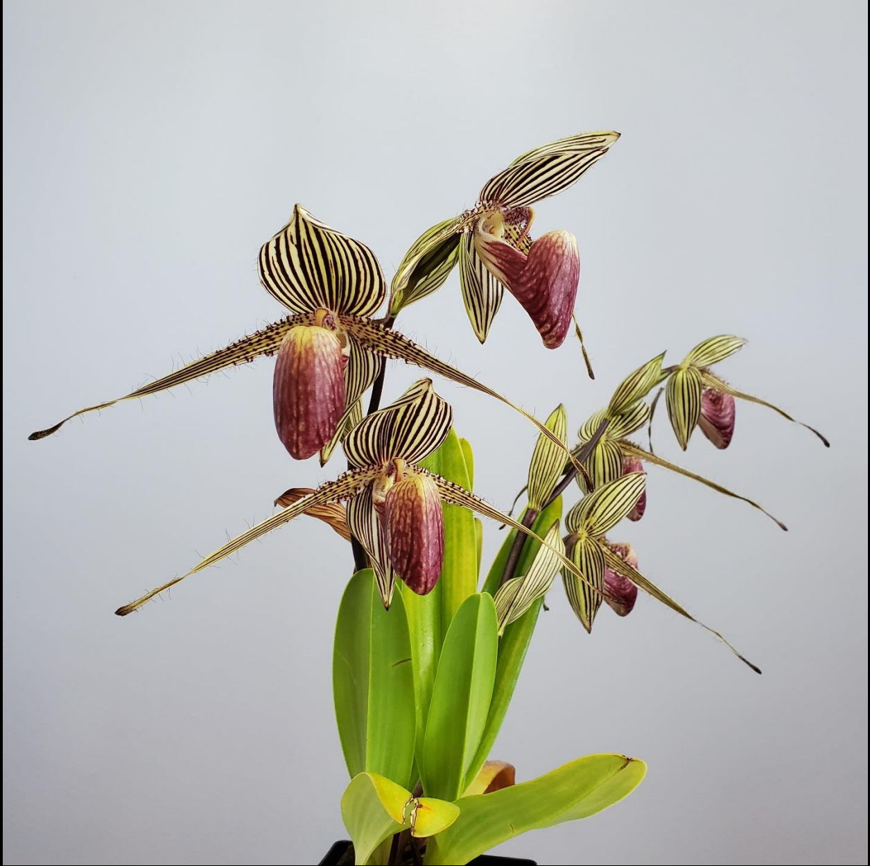
Paphiopedilum rothschildianum 'Winter Star' x 'Western Monarch'