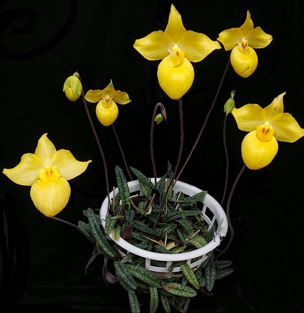
Paphiopedilum armeniacum 'Orchid Court' CCM/AOS Grown by Tennis Maynard

The Plant of the Month from our March meeting is an incredible specimen plant grown by Tennis Maynard. With eight inflorescences on 50+ growths, this Paphiopedilum armeniacum is grown up high in the greenhouse for maximum light, kept moist in a basket with a fine bark mix. Tennis puts the plant outdoors after winter is done, for a hot summer and a cold fall, staying out until the nights have stayed down around 40°F as long as possible.