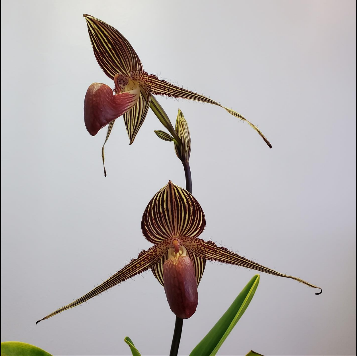
Paphiopedilum rothschildianum 'Sam's Choice' x 'MM Best'