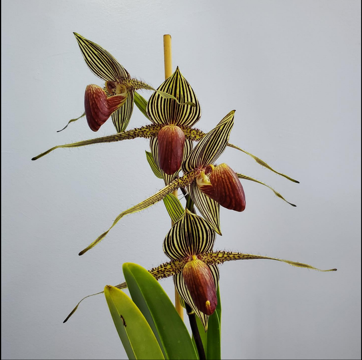
Paphiopedilum rothschildianum 'Chester Hill' x 'Red Baron'