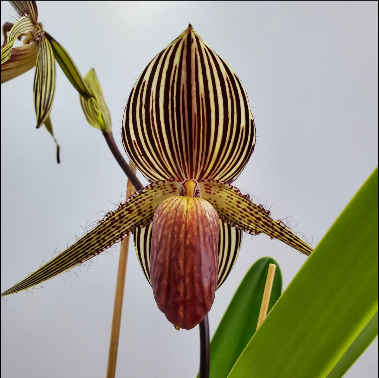
Paphiopedilum rothschildianum 'Chester Hill' x 'Red Baron'