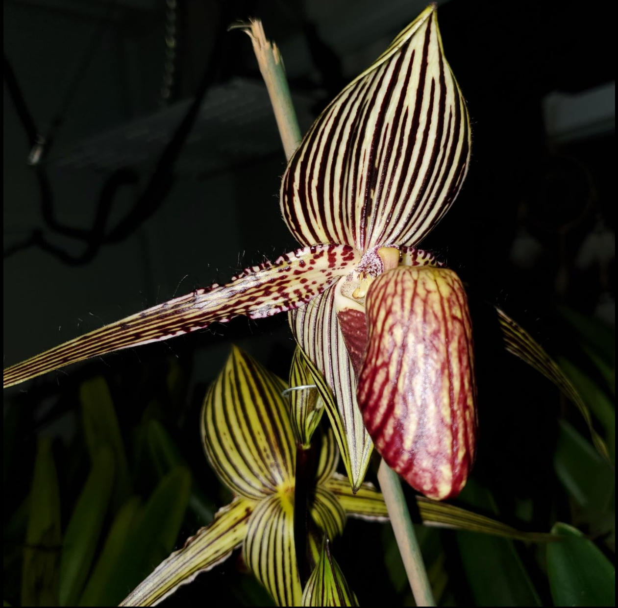
Paphiopedilum rothschildianum 'Borneo' FCC/AOS