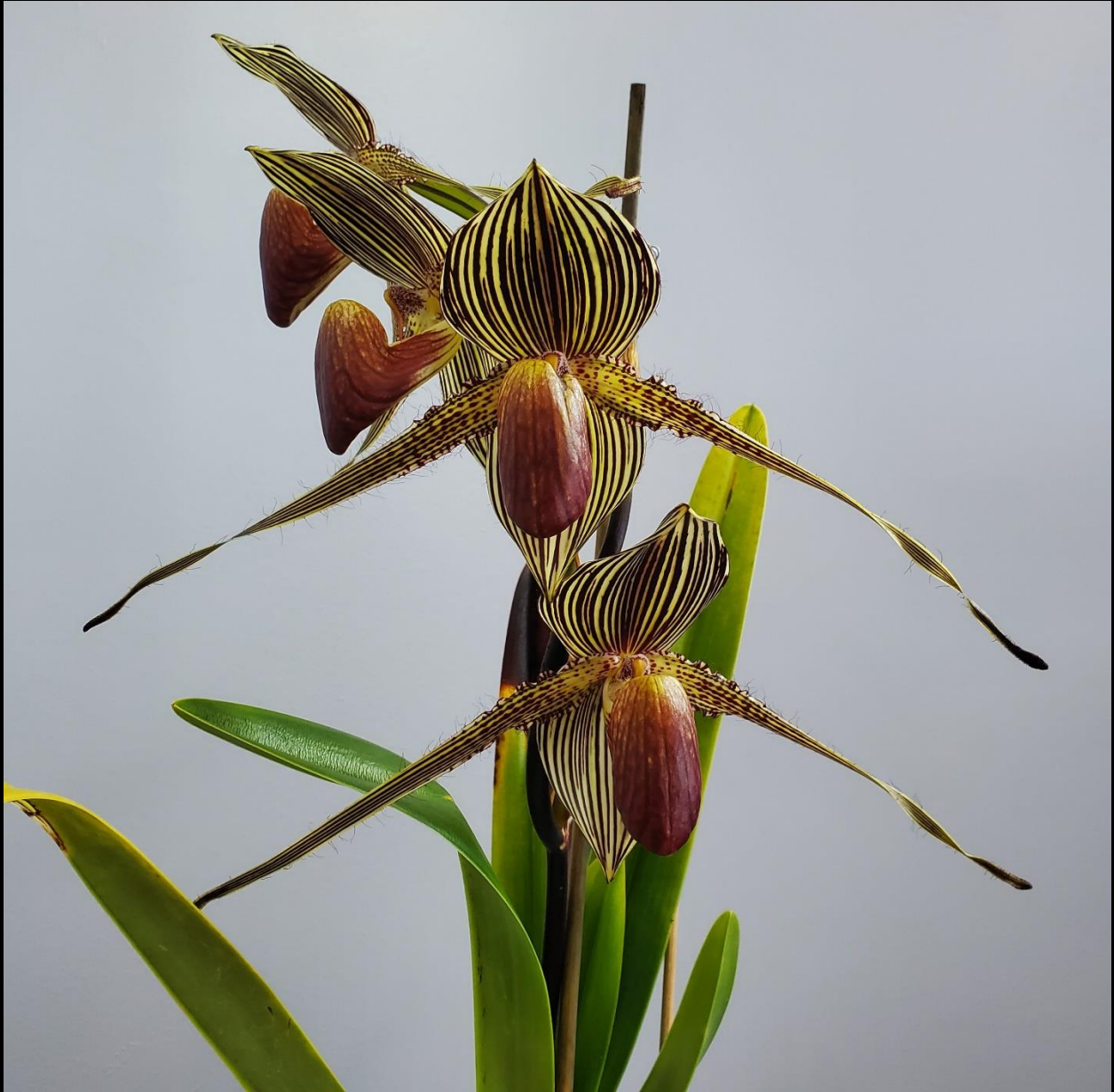
Paphiopedilum rothschildianum 'Chester Hill' x 'Red Baron'